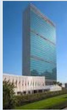
UNITED NATIONS Land Assemblage