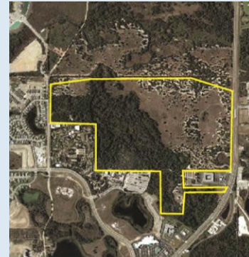
CHINA OWNED CHINA TRAVEL SERVICES, FORMER SPLENDID CHINA THEME PARK Land disposition