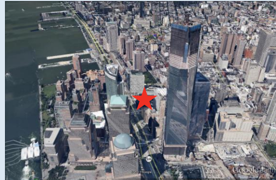
101 MURRAY ST, TRIBECA, MANHATTAN 31,028 SF site, land disposition for St. John's University.